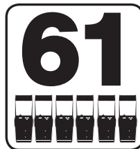
CLASSIC ARCADE GAMES

5684 York Blvd. Los Angeles, CA 90042 infolosangeles@barcade.com