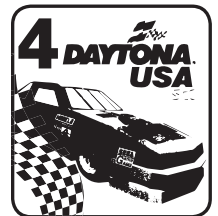
4 PLAYER! DAYTONA USA DELUXE!