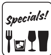
FOOD AND DRINK SPECIALS DAILY