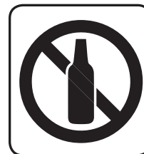
NO BOTTLED BEER